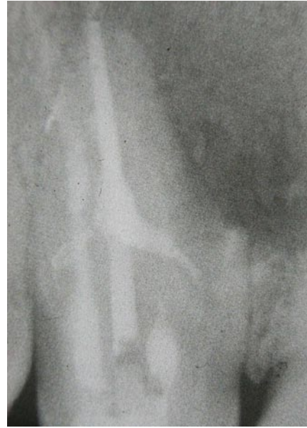
Root canal treatment of an UR2 with Dens in Dente, showing signs of healing after 6 months post operatively.