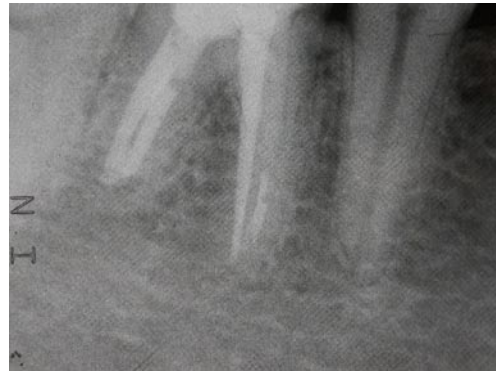
Root canal re-treatment of a LR6 with apical periodontitis associated with an existing root filling. Placement of a fibre post in the Mesiolingual canal and composite core in the coronal 4mm of the distal canals.