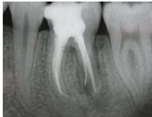
Root canal treatment of a LL6 with three roots.