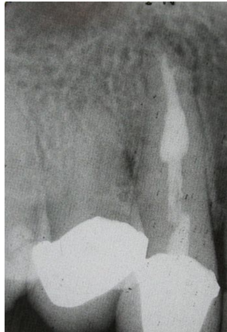
Repair of perforated UR3 and treatment of an infected necrotic pulp and an internal resorption.