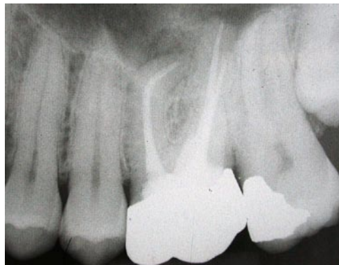
Treatment of Chronic apical periodontitis associated with infected necrotic pulp.